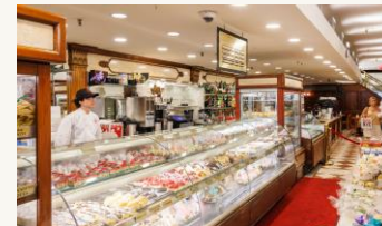
Ferrara Bakery & Cafe