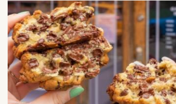
Funny Face Bakery