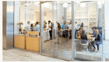
Blue Bottle Coffee