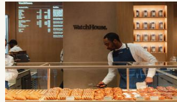
WatchHouse 5th Ave