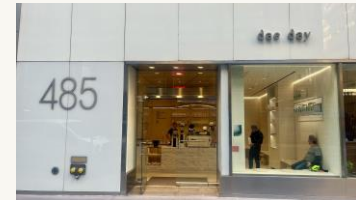
Dae day coffee